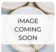
IMAGE COMING SOON

250g - (467G-Cal 29.5G-Protein 34G-Fat 9G-Carbs ) 350g - (653G-Cal 41.3G-Protein 47.6G-Fat 12.6G-Carbs ) 400g - (746G-Cal 47.2G-Protein 54.4G-Fat 14.4G-Carbs ) Atlantic Salmon, Olive Oil, Lemon, Pepper, Dill, Parmesan Cheese, Butter, Nutmeg Powder, Onion, Garlic, Salt, Bay Leaves, Thickened Cream, Potato, Dijon Mustard, Fennel, Rocket, Radish, Walnut, Greek Lemon Dressing